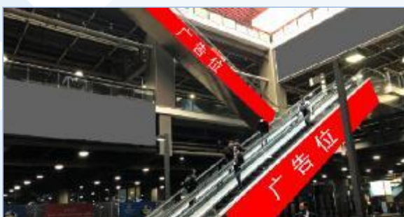
C13 Escalator advertisement - East / North Skylight

Specification: Front, back-4m (H) x 8m (W) Lateral side-4m (H) x 2m (W) Price: RMB 75,000