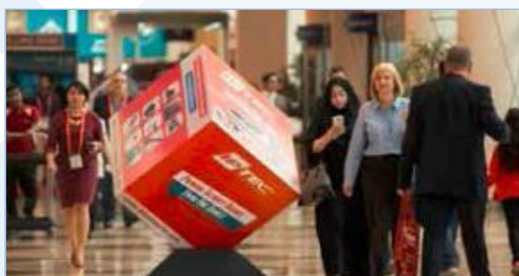
C19 Cube sign (pedestrian walkway)

Specification: 3.25m(H) x 9.4m(W) *contact organisers for dimension details Price: RMB 50,000