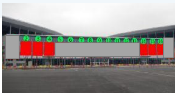
C20 North Hall glass wall advertisement

Specification: Cube: 1m(H) x 1m(W) x 1m(D) x 6-side Price: RMB 60,000