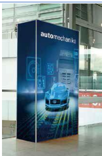
C23 North Hall advertisement panel inside registration tent (3-side)

Specification: 2.5m(H) x 1.5m(W) 2.5m(H) x 0.5m(W) x 2-side Price: RMB 25,000