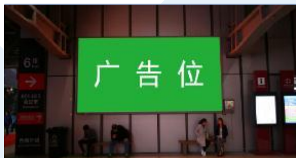
C10 Lightbox – Diamond building in commercial plaza (new)

Specification: 2.2m (H) x 4m (W) Price: RMB 20,000