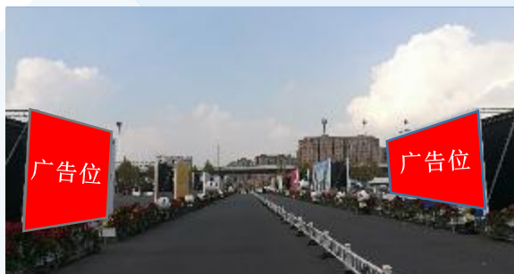
C02 Billboard – North Square

Specification: 3m (H) x 12m (W) Price: RMB 35,000