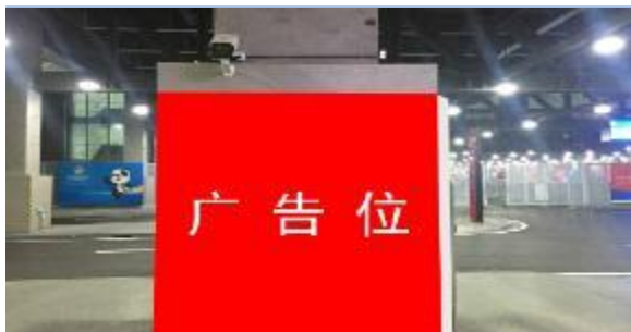
C06(b) Billboard – Metro station exit no.5 (new)

Specification: 2m (H) x 2m (W) Price: RMB 35,000