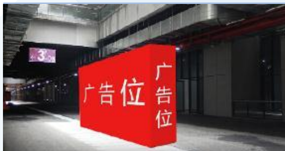
C12 Advertisement panel along drive way on 1st floor (4-side)

Specification: 5m(H) x 12m(W) Price: RMB 72,000