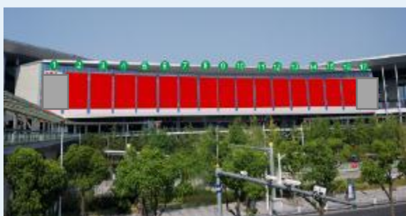
C21 West Hall glass wall advertisement (new)

Specification: 9m(H) x 8m(W) Price: RMB 168,000