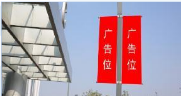
C25 Road flag advertisement (new)

Specification: 3.06m(H) x 1.76m(W) / each (5 pcs / set) Price: RMB 80,000 / set