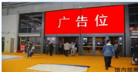
C18 Glass wall advertisement above hall entrance (inside hall)

Specification: 2.6m(H) x 4m(W) Price: RMB 25,000