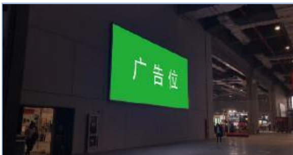
C11 In hall wall partition lightbox advertisement (new)

Specification: 5m(H) x 12m(W) Price: RMB 72,000