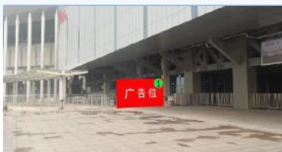
C04 Billboard – East / West Square (new)

Specification: 4m(H) x 12m(W) x 2-side Price: RMB 120,000