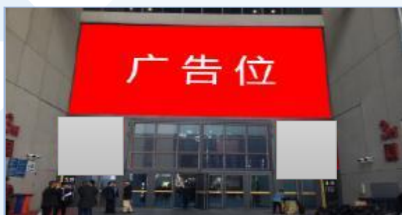
C08(a) Glass wall advertisement – Main entrances on 1st floor

Specification: 2.8m (H) x 11m (W) Price: RMB 35,000