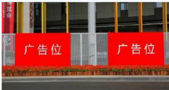
C26 Inner fence advertisement (new)

Specification: 2.1m(H) x 0.7m(W) / painting, 2-side (2 paintings for 1 set, 30 pcs / set) Price: RMB 180,000 / set