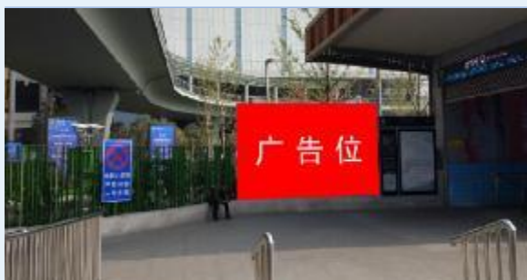
C05 Billboard – Metro station exit no.6

Specification: 4m(H) x 8m(W) Price: RMB 120,000