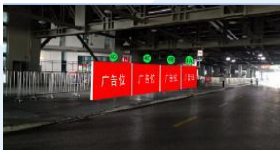
C06(a) Billboard – Metro station exit no.4 / 5

Specification: 3m (H) x 5m (W) Price: RMB 30,000