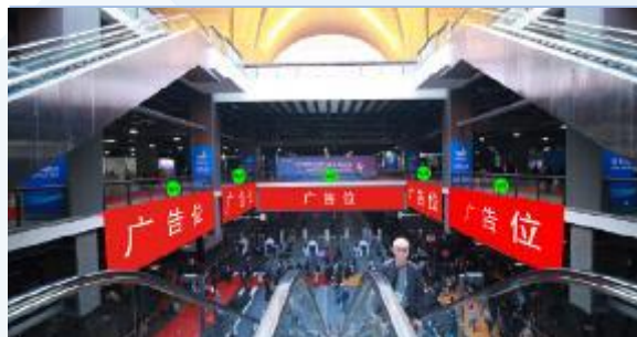
C07 Canvas advertisement – Skylight at East / West esplanade

Specification: 2m (H) x 2m (W) Price: RMB 35,000