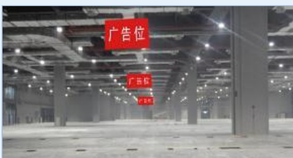
C15 Hanging banner inside double - story halls (2-side)

*Hanging banner can only be hung above the booth of advertiser. Please consult the organisers for exact hanging points Specification: 12m(H) x 8m(W) Price: RMB 180,000