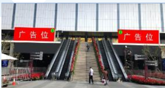
C03 Billboard – West Square (2-side)

Specification: 4m (H) x 8m (W) x 2-side Price: RMB 72,000