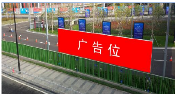
C01 Billboard – Main entrance (external)

Specification: 3m (H) x 12m (W) Price: RMB 35,000