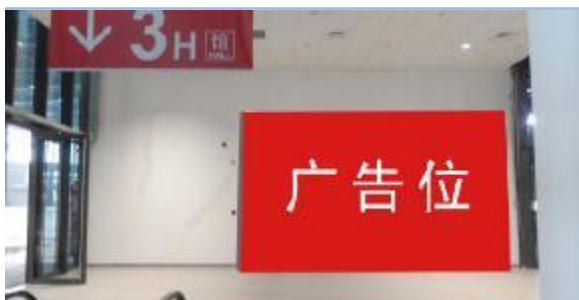
C17 In hall escalator advertisement - Mezzanine floor

Specification: 2.6m(H) x 4m(W) Price: RMB 25,000