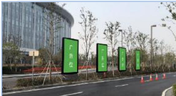
C24 Lightbox – Lamp piece in square (new)

Specification: 2.5m(H) x 1.5m(W) 2.5m(H) x 0.5m(W) x 2-side Price: RMB 25,000