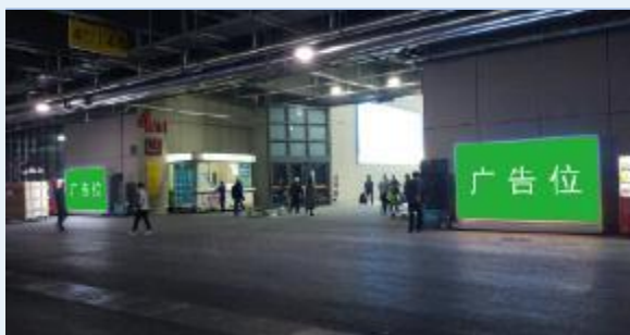
C09 Lightbox along drive way against wall on 1st floor

Specification: 3.6m (H) x 3.4m (W) Price: RMB 35,000