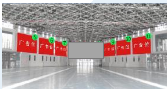
C22 Hanging banner inside North Hall

Specification: 13m(H) x 8m(W) Price: RMB 128,000