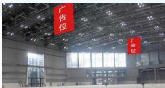
C14 Hanging banner inside single - story halls (2-side)

Specification: 1.5m(H) x 15m(W) *contact organisers for dimension details Price: RMB 30,000